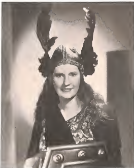
Mrs. Kirsten Flagstad in the costume of Brünnhilde in "Die Walküre"

How to achieve it? As always, I find it difficult to lay down systems of rules for other singers to follow. Singing is so individual a matter that one hesitates to venture upon general pronouncements. Indeed, the ultimate value of singing is largely determined by individualities of constitution, temperament, and approach. Happily enough, there are no fixed formulas in art. Two interpretations of the same rôle may differ widely, yet both may be "right," in the sense that both reflect an honest and sincere effort to bring to light the intention of the composer—which is the goal of all earnest interpretive work. For this reason, I cannot tell others what to do. But I am glad to speak of my own experience. To me, the beginning of a new rôle roots in brain work rather than vocal work. Before I sing a single note of music, I sit down with the score